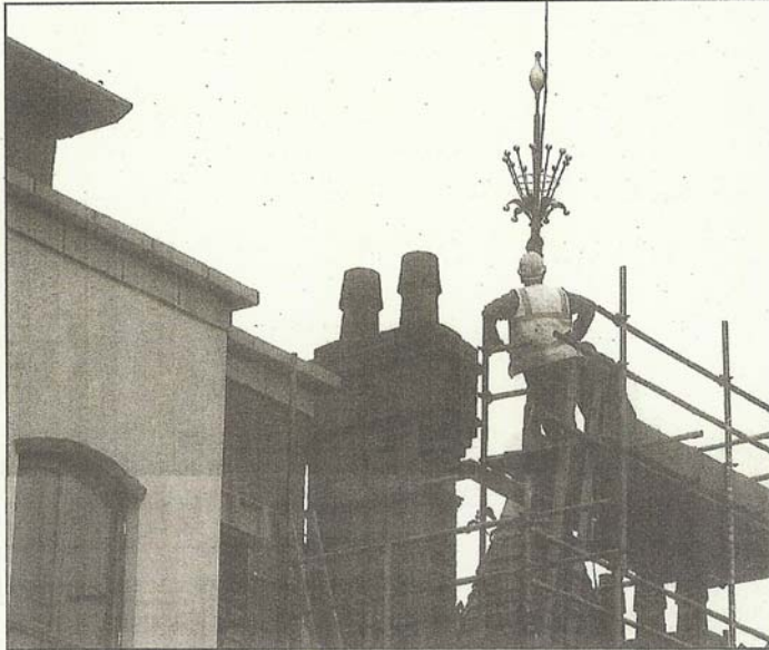
RESTORED: The Watson Fothergill finial is finally replaced